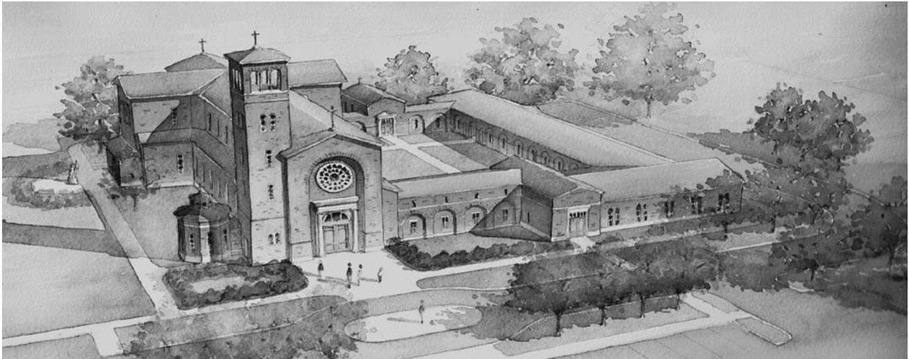
Preliminary rendering of the new St. Joan of Arc Church

Traditional Latin Rite Parish of the Diocese of Boise Priestly Fraternity of St. Peter