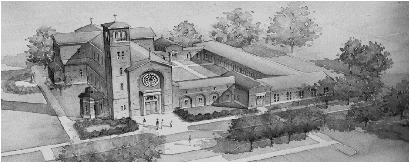
Preliminary rendering of the new St. Joan of Arc Church

Traditional Latin Rite Parish of the Diocese of Boise Priestly Fraternity of St. Peter