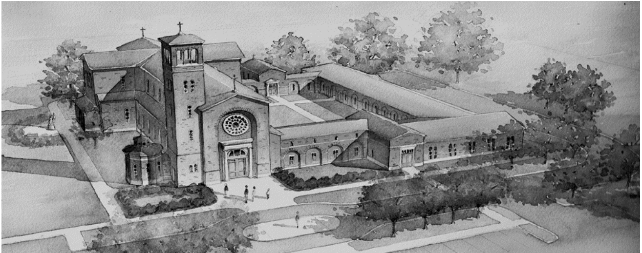
Preliminary rendering of the new St. Joan of Arc Church

Traditional Latin Rite Parish of the Diocese of Boise Priestly Fraternity of St. Peter