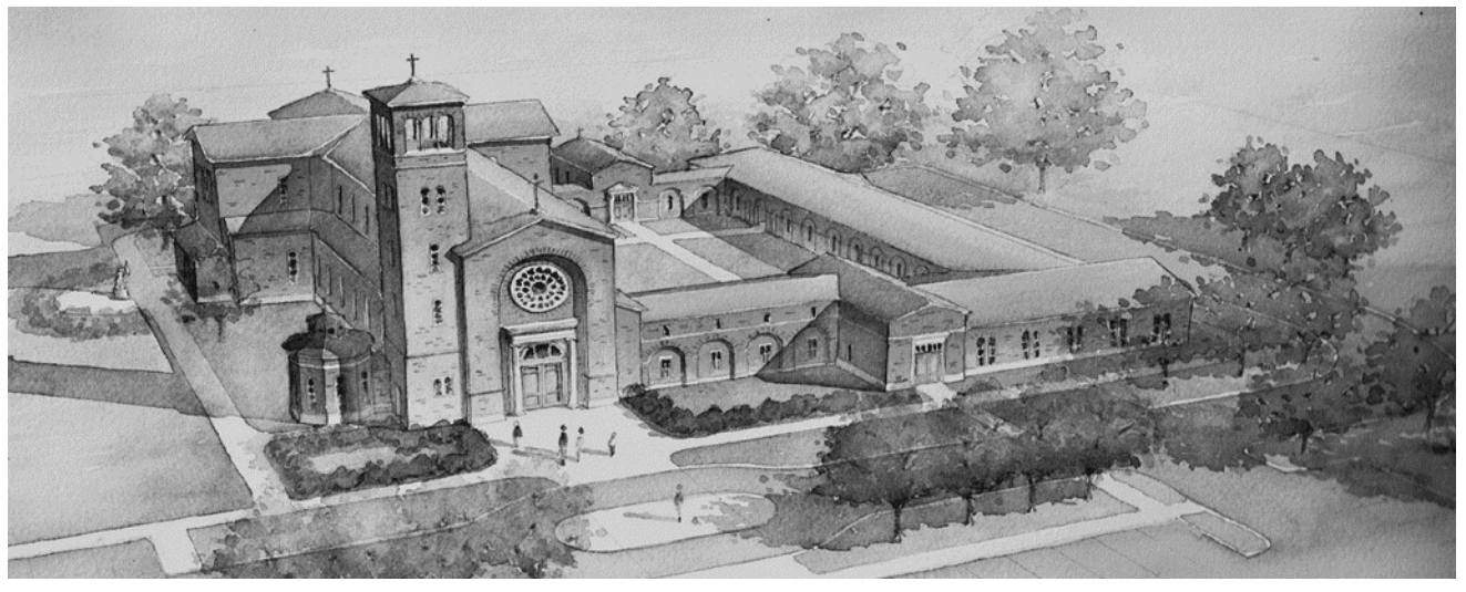
Preliminary rendering of the new St. Joan of Arc Church

Traditional Latin Rite Parish of the Diocese of Boise Priestly Fraternity of St. Peter