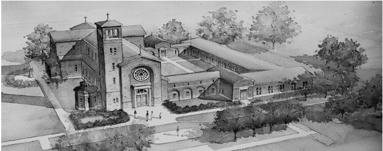
Preliminary rendering of the new St. Joan of Arc Church

Traditional Latin Rite Parish of the Diocese of Boise Priestly Fraternity of St. Peter