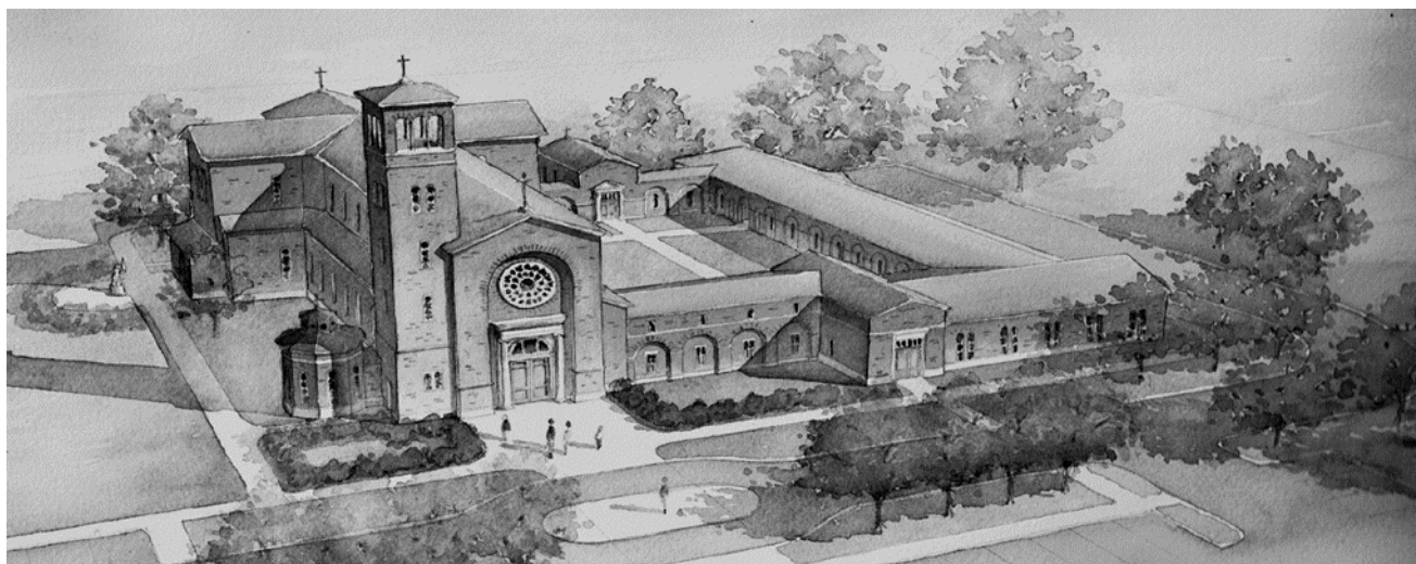
Preliminary rendering of the new St. Joan of Arc Church

Traditional Latin Rite Parish of the Diocese of Boise Priestly Fraternity of St. Peter