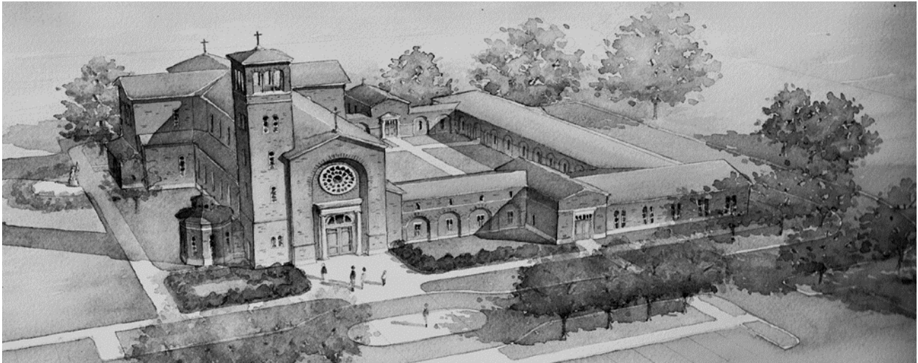
Preliminary rendering of the new St. Joan of Arc Church

Traditional Latin Rite Parish of the Diocese of Boise Priestly Fraternity of St. Peter