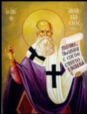
St. athanasius of alexandria

“But what is also to the point, let us note that the very tradition, teaching and faith of the Catholic Church from the beginning, which the Lord gave, was preached by the Apostles, and was preserved by the Fathers.”