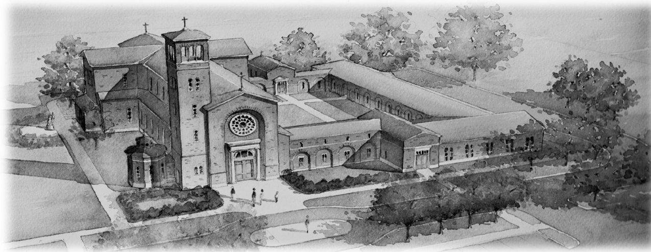
Preliminary rendering of the new St. Joan of Arc Church

Traditional Latin Rite Parish of the Diocese of Boise Priestly Fraternity of St. Peter