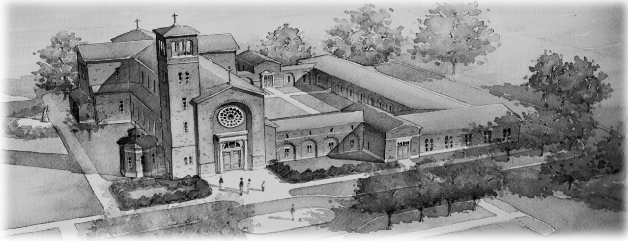
Preliminary rendering of the new St. Joan of Arc Church

Traditional Latin Rite Parish of the Diocese of Boise Priestly Fraternity of St. Peter