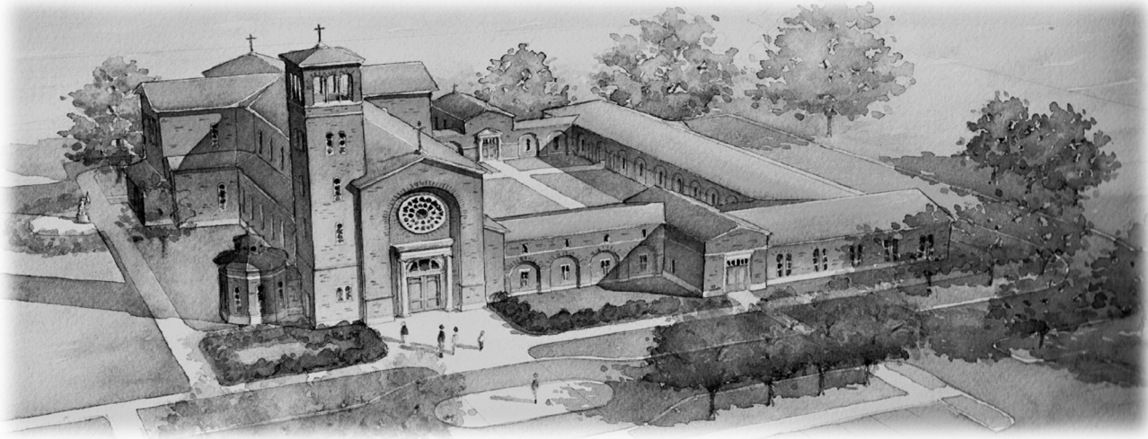
Preliminary rendering of the new St. Joan of Arc Church

Traditional Latin Rite Parish of the Diocese of Boise Priestly Fraternity of St. Peter