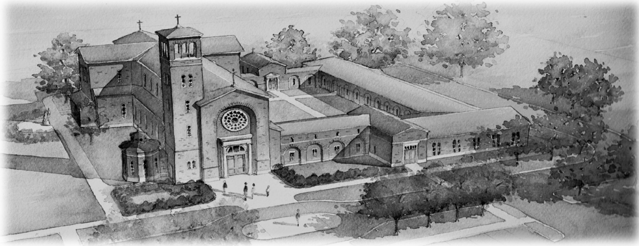
Preliminary rendering of the new St. Joan of Arc Church

Traditional Latin Rite Parish of the Diocese of Boise Priestly Fraternity of St. Peter