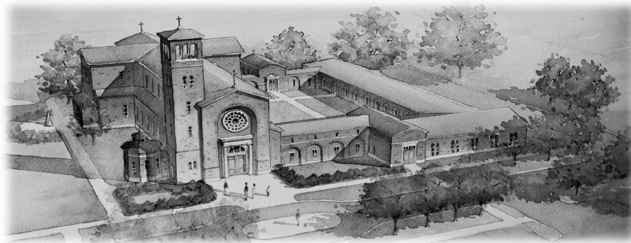
Preliminary rendering of the new St. Joan of Arc Church

Traditional Latin Rite Parish of the Diocese of Boise Priestly Fraternity of St. Peter