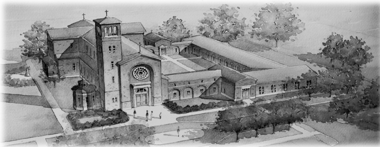
Preliminary rendering of the new St. Joan of Arc Church

Traditional Latin Rite Parish of the Diocese of Boise Priestly Fraternity of St. Peter