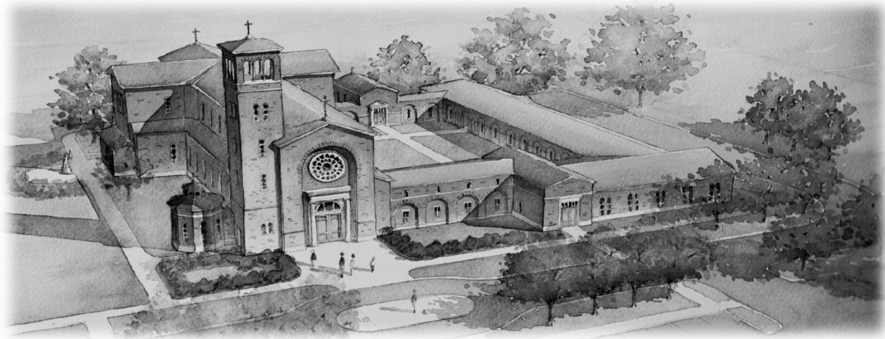
Preliminary rendering of the new St. Joan of Arc Church