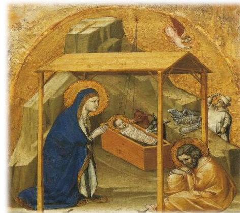
Coronation of the Virgin Altarpiece: Nativity Guariento di Arpo, 1344