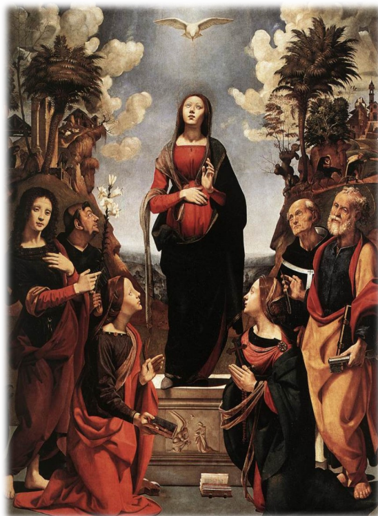
The Immaculate Conception With Saints Piero di Cosimo, circa 1490