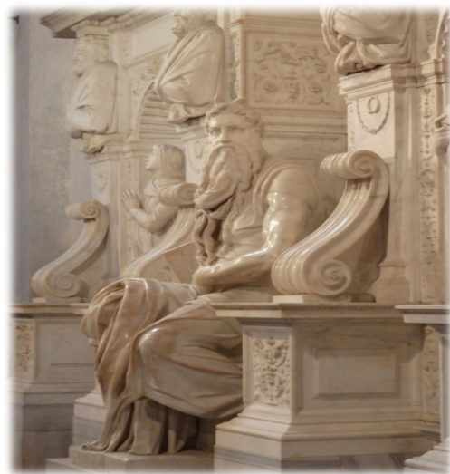
Moses by Michelangelo