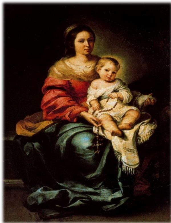
..... The Virgin of the Rosary Bartolomé Esteban Murillo, 1650 .....

them is the virtue of penance, and one part of this is abstinence, which for more reasons than one is necessary and salutary. It is true the Church is growing more indulgent towards her children in this matter, but they must understand they are bound to take all care to make up for this maternal indulgence by other good works. We rejoice for this reason also to propose particularly the use of the rosary, which is capable of producing worthy fruits of penance, especially by the remembrance of the sufferings of Christ and His Mother.