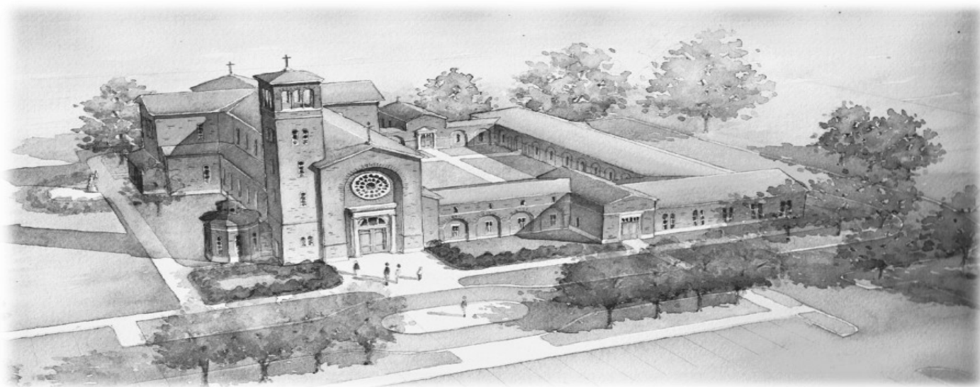
Preliminary rendering of the new St. Joan of Arc Church