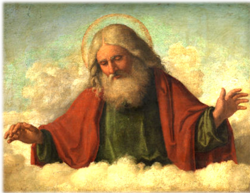
..... God the Father