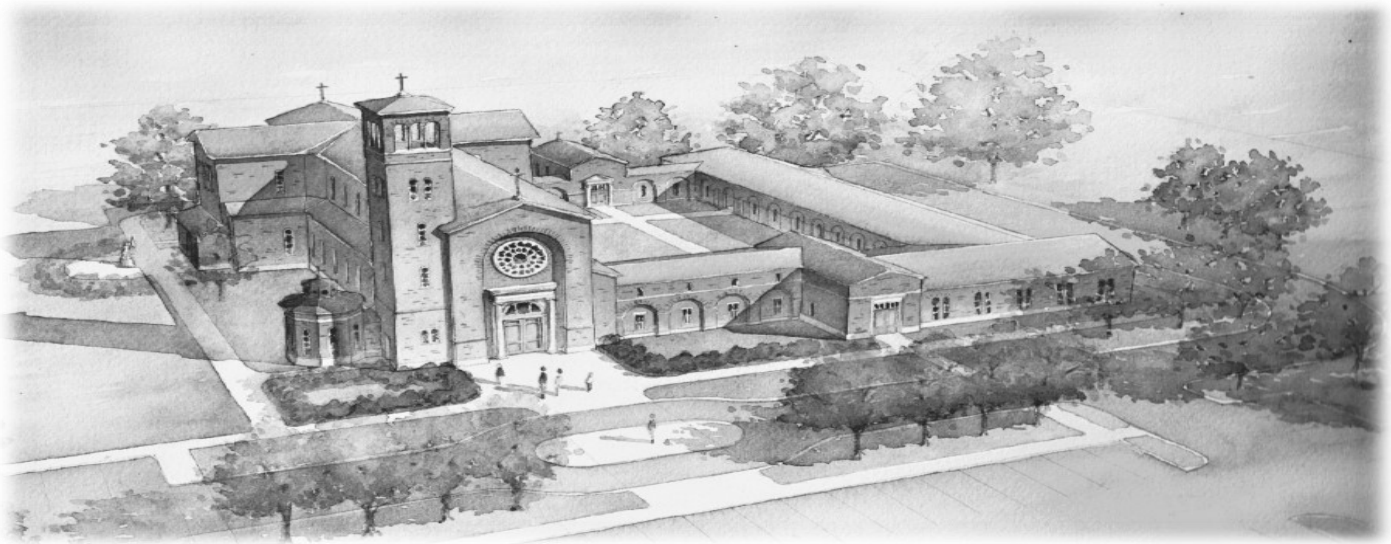
Preliminary rendering of the new St. Joan of Arc Church