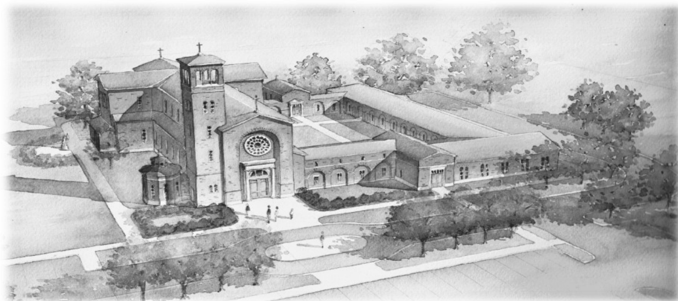
Preliminary rendering of the new St. Joan of Arc Church

Traditional Latin Rite Parish of the Diocese of Boise