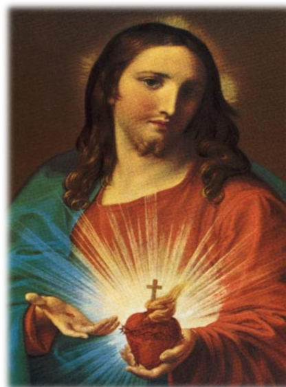
Sacred Heart of Jesus Pompeo Batoni, 1767