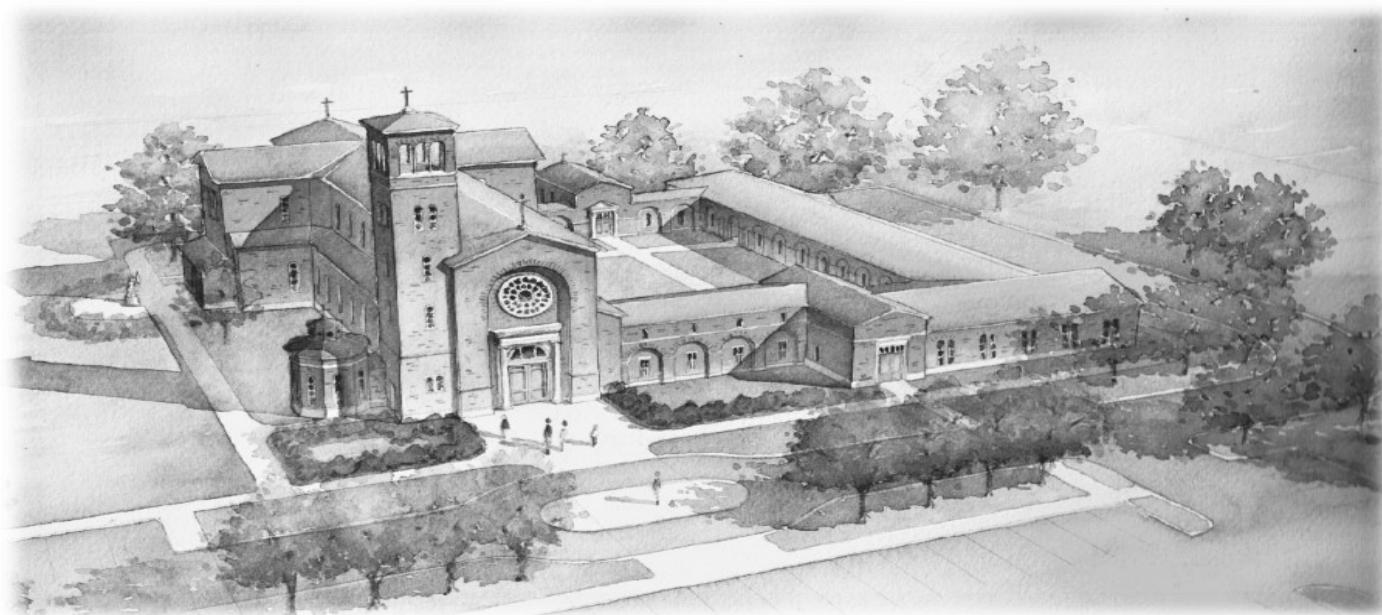
Preliminary rendering of the new St. Joan of Arc Church

Traditional Latin Rite Parish of the Diocese of Boise