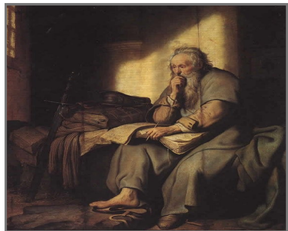
..... St. Paul in Prison Rembrandt Harmen van Rijn, 1627 .....

“So the ‘works of the law’ (the Old Law ; circumcision) don’t have a bearing on our salvation, but according to the Bible, good deeds (or the lack of thereof) do have a bearing on our salvation!”