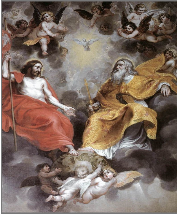
..... Baroque Trinity Hendrick van Balen, 1620 .....

God knew from all eternity that he could make an innumerable multitude of creatures with divers perfections and qualities, to whom he might communicate himself, and considering that amongst all the different communications there was none so excellent as that of uniting himself to some created nature, in such sort that the creature might be engrafted and implanted in the divinity, and become one single person with it, his infinite goodness, which of itself and by itself tends towards communication, resolved and determined to communicate himself in this manner. So that, as eternally there is an essential communication in God by which the Father communicates all his infinite and indivisible divinity to the Son in producing him, and the Father and the Son together producing the Holy Ghost communicate to him also their own singular divinity;—so this sovereign sweetness was so perfectly communi-