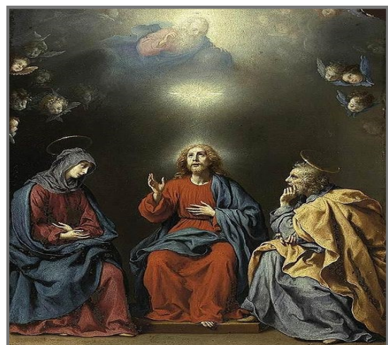
..... The Holy Family with God the Father and the Holy Spirit Carlo Dolci, circa 1630 .....