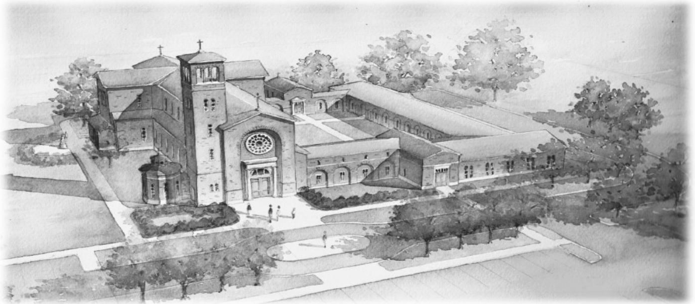
Preliminary rendering of the new St. Joan of Arc Church

Traditional Latin Rite Parish of the Diocese of Boise