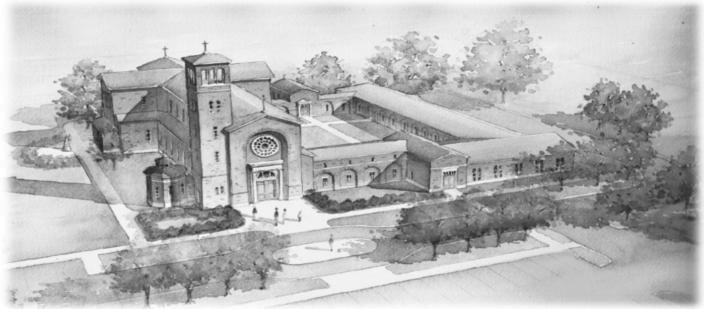
Preliminary rendering of the new St. Joan of Arc Church

Traditional Latin Rite Parish of the Diocese of Boise