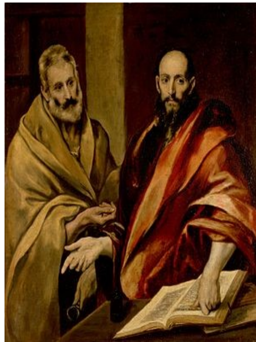
Saint Peter and St. Paul